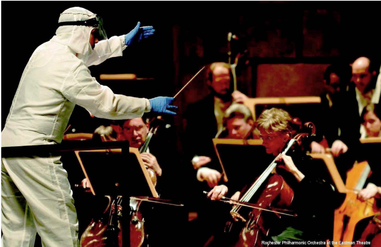
Rochester Philharmonic Orchestra at the Eastman Theatre

Just the RIGHT CULTURE FOR THE BIOTECH INDUSTRY.